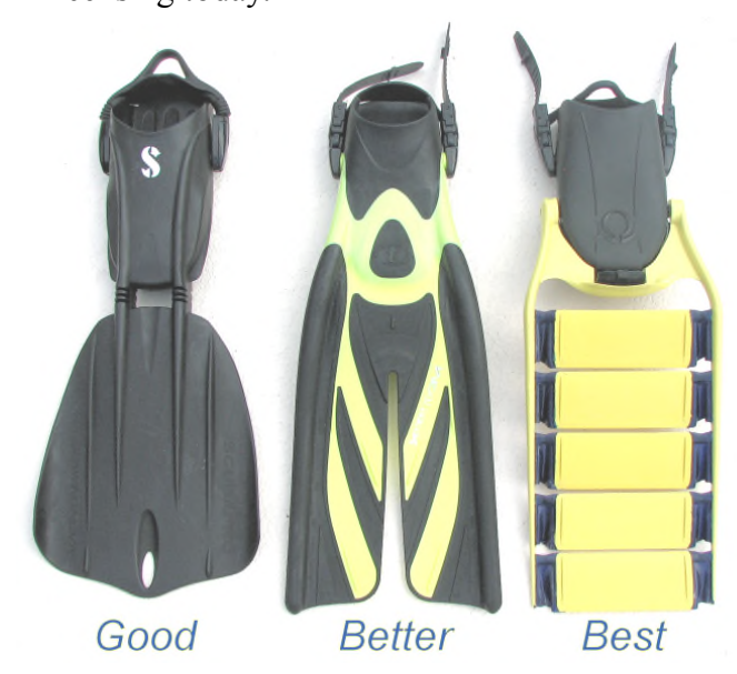
(Thanks to Omega Aquatics/Flipfin LLC for the use of their foot pockets for this project)

Be the first to introduce the new standard in swimming efficiency. Contact David Woods for licensing today.